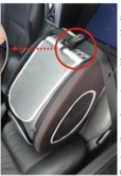
Fasten the velcro strap with seat belt as car seat.