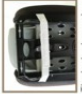
The look when velcro strips fix with pull rod.