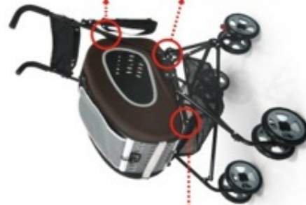
Attach rear velcro strip to stroller frame.