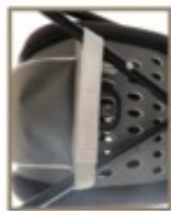
The look when velcro strips fixed with frame.