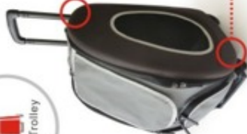
Fix the velcro strip with pull rod as picture shown.