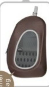
EVA Carrier Bag